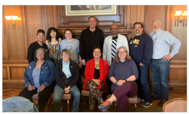
Members of Council and the OHA Executive Office staff at the 2022 Mid Winter Meeting in Los Angeles.

Council met in March in Los Angeles, our first time together in person since February 2020. It was such a joy to share food and walks, and we got a lot done. To close our meeting, we each took some time to go over our 2020-2023 Strategic Plan and see how we were doing. It was exciting! Even while living through a pandemic, we have made significant progress on our goals.