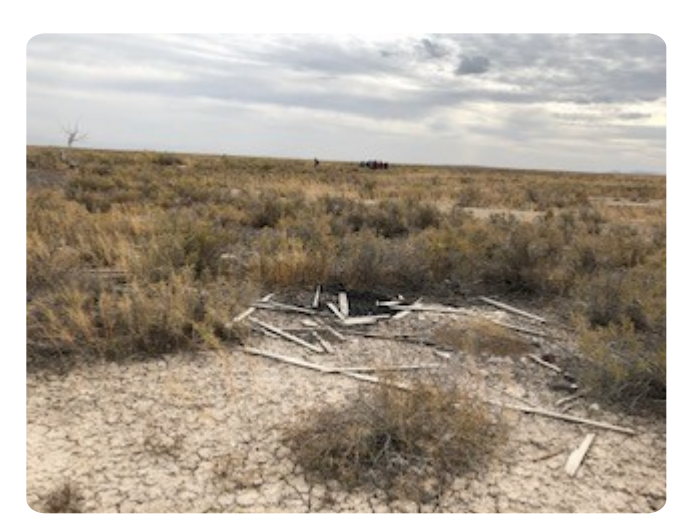
Barracks site, Topaz Relocation Center, former Japanese-American internment camp, October 2019

For more information about the site and museum visiting hours, check out: http://topazmuseum.org/