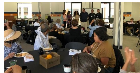
Attendees at 2018 SOHA Awards Luncheon, CSU Fullerton