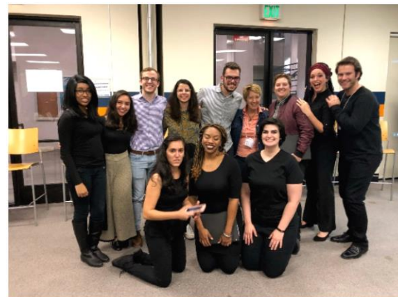
"Voices from the March" student performers from the University of Florida