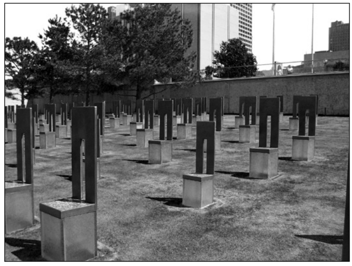
Oklahoma City National Memorial and Museum

Memorial ideas emerged spontaneously and immediately, he said, giving rise to quilt-making, tree-planting, concerts and athletic events.