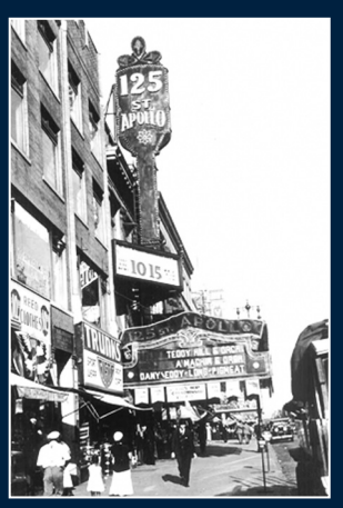
Apollo Theater, New York, NY