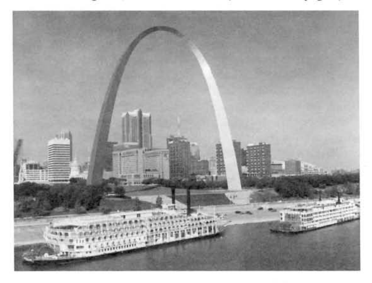
The landmark Gateway Arch soars over the St. Louis skyline.

Send to: 7524 S. 35th St., Lincoln, NE 68516. Fax: 402-420-1770. E- mail: OHAEditor @aol.com.