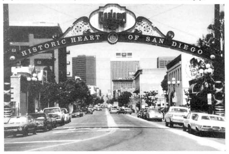
San Diego's historic Gaslamp Quarter drew OHA visitors.

+ verbal snapshots from just a handful of the dozens of thoughtprovoking presentations. Read. Learn. And enjoy.