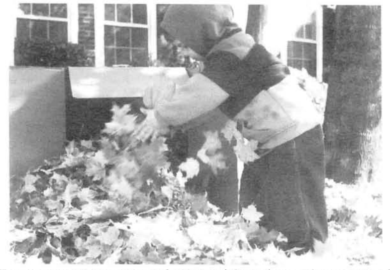
You, too, can enjoy autumn in the National Capital area when you attend the 2003 OHA annual meeting Oct. 8-12 in Bethesda, Md.

The Friday morning featured activity will be a behind-the-scenes tour of the Library of Congress. Like the Pentagon, the Library of Congress is not available for tours on the weekend, so, in a departure from