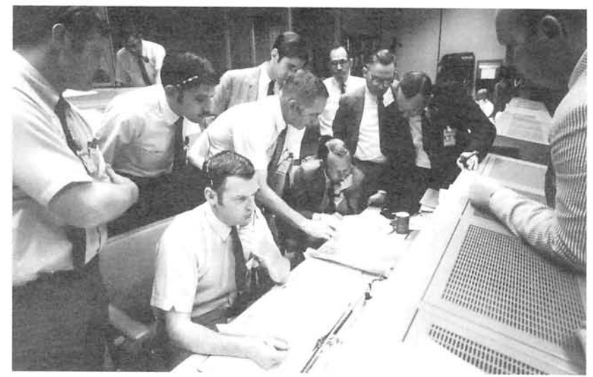
Flight controllers study a weather map to find a landing site for Apollo 13, after an on-board explosion caused cancellation of the lunar landing.

The book's companion CD-ROM serves as a repository of information about the space program and sets the stage for the International Space Station. It features more than 600 images, 145 video clips and animations, diagrams of U.S. and Russian spacecraft and 74 participant oral histories. Also available are the Shuttle-Mir and Shuttle mission status reports, mission summaries, NASA news releases, interviews, personal letters from the NASA Mir astronauts, science reports and other published documents used as source material for the book. The NASA