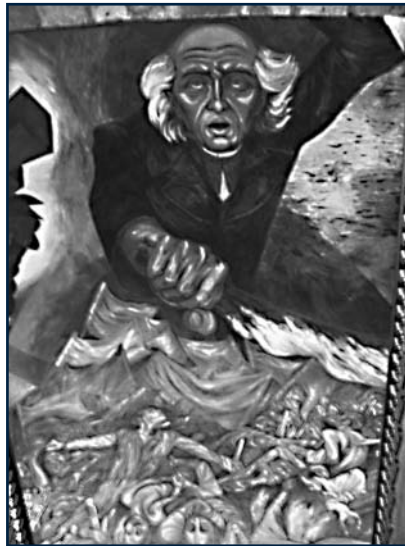
A spectacular mural of Don Miguel Hidalgo, painted by José Clemente Orozco, appears high over a staircase at the Palacio del Gobierno, where Hidalgo declared an end to Mexican slavery.