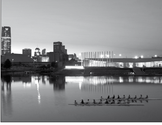
Oklahoma City Skyline, courtesy of the Oklahoma City Convention Visitors Bureau.