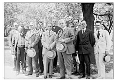
Alien Property Custodian Executive Staff, 1918.