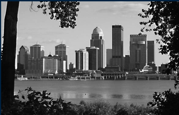
Skylines of Louisville, Kentucky, site of the 2009 OHA conference (page 5).