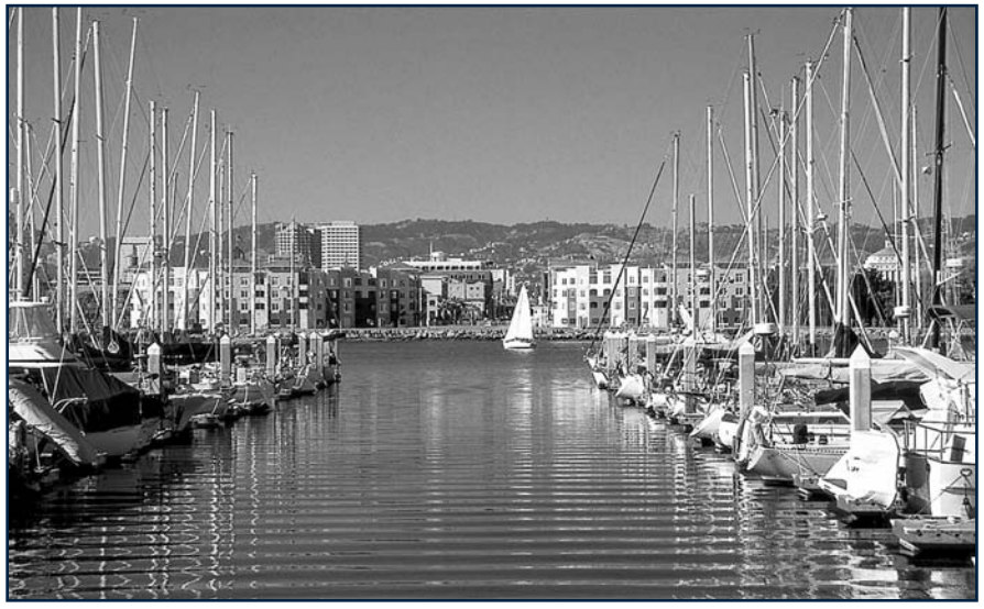
Sailboats-courtesy of the Oakland Convention & Visitors Bureau. Photo by Barry Muniz.