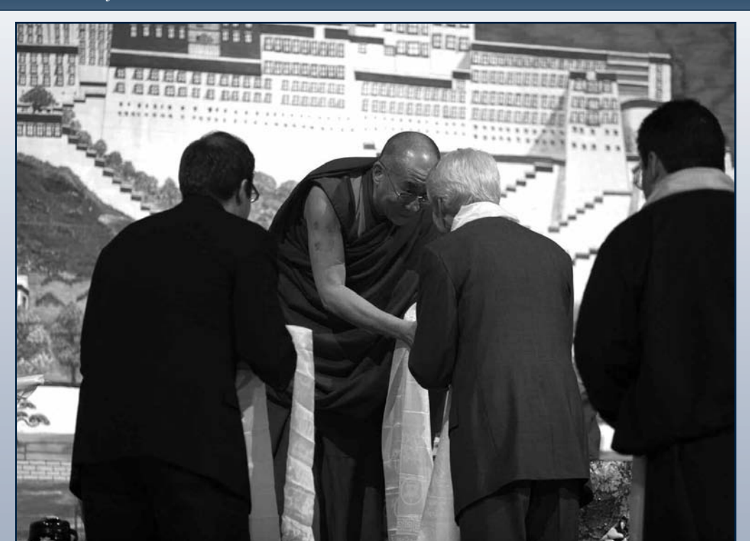
Dalai Lama, center, receives oral histories from James Fogerty.

The presentation took place before nearly 2,000 people gathered for a ceremony at the Minneapolis Convention Center. The transcripts represent interviews with members of Minnesota's Tibetan community. With nearly 1,300 members, it is the second largest Tibetan community in the nation. The transcripts were placed in a custom-made, silk covered presentation case constructed in the society's conservation laboratory.