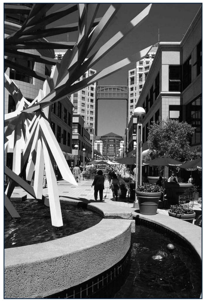
Oakland City Center—courtesy of the Oakland Convention & Visitors Bureau. Photo by Barry Muniz.