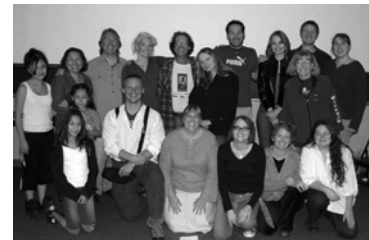
Romero Theater Troupe