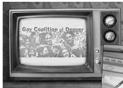
Gay Revolt.