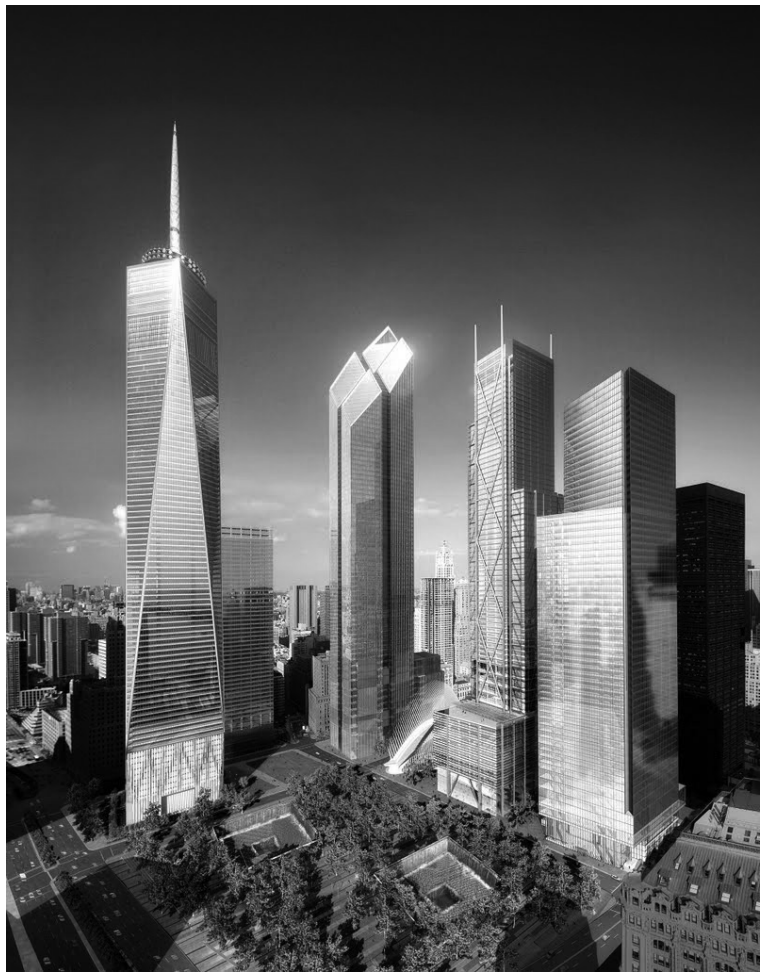
The final proposed design for the rebuilding of the World Trade Center. The September 11th Memorial is in the park in the foreground.