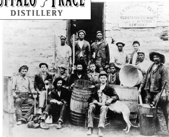
The Distillery in 1870.